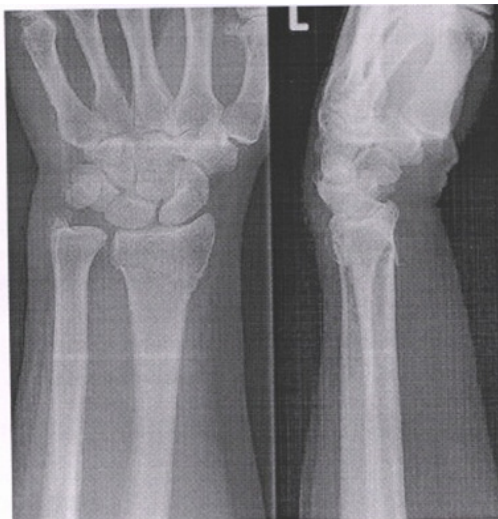
Fig-3: Preoperative X-ray